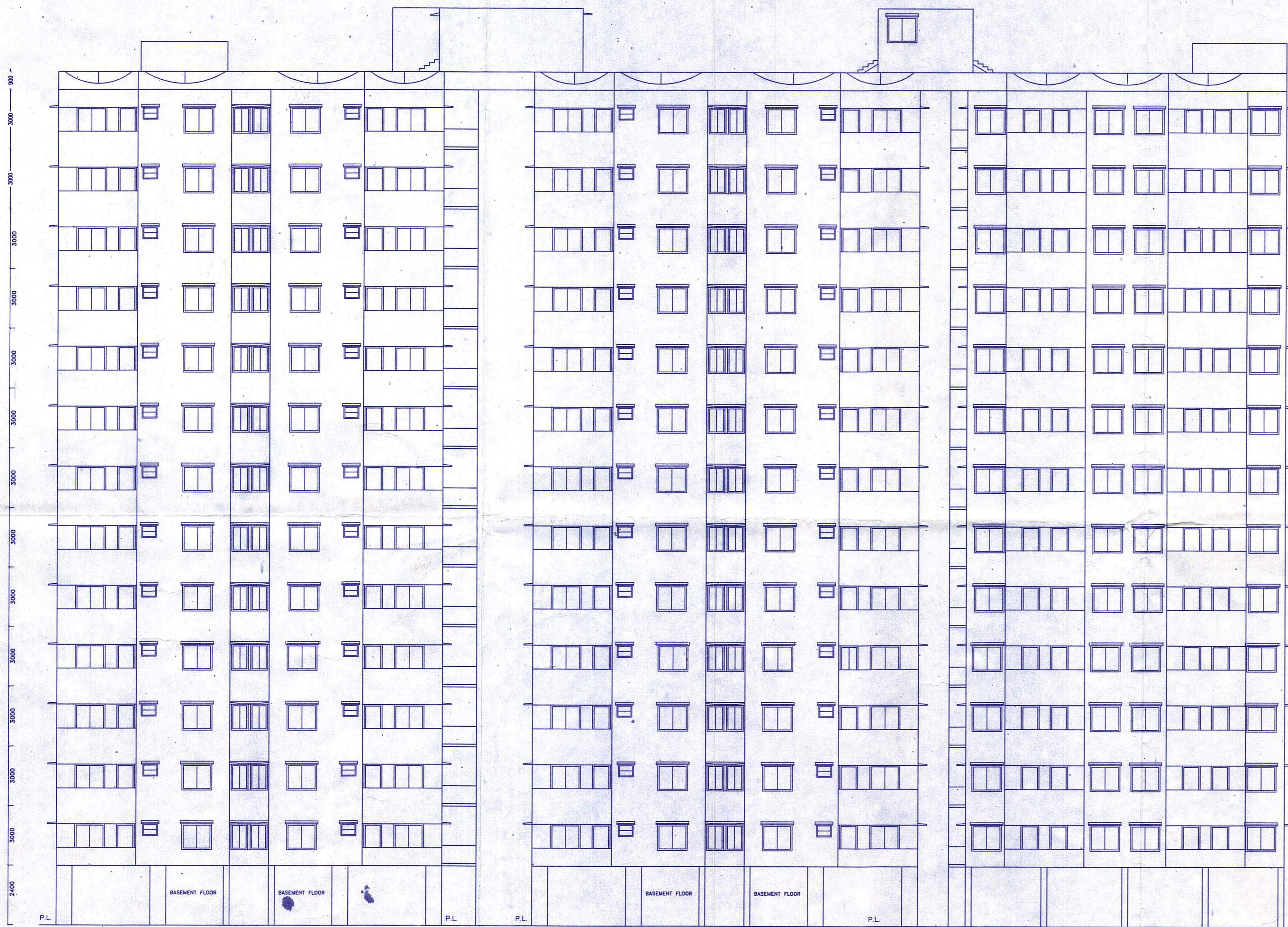
ELEVATION PLAN SCALE-1:100